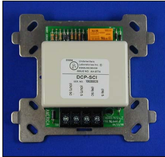
Back side of a DCP-SCI

The contractor shall furnish and install where indicated on the plans, the Hochiki DCP-SCI short circuit isolator. The modules shall be UL listed compatible with Hochiki Digital Communications Protocol (DCP) supporting control panel loops. The isolator module must be suitable for mounting in a standard 4" square electrical box or double gang. The isolator module must provide a yellow LED for indication of status.